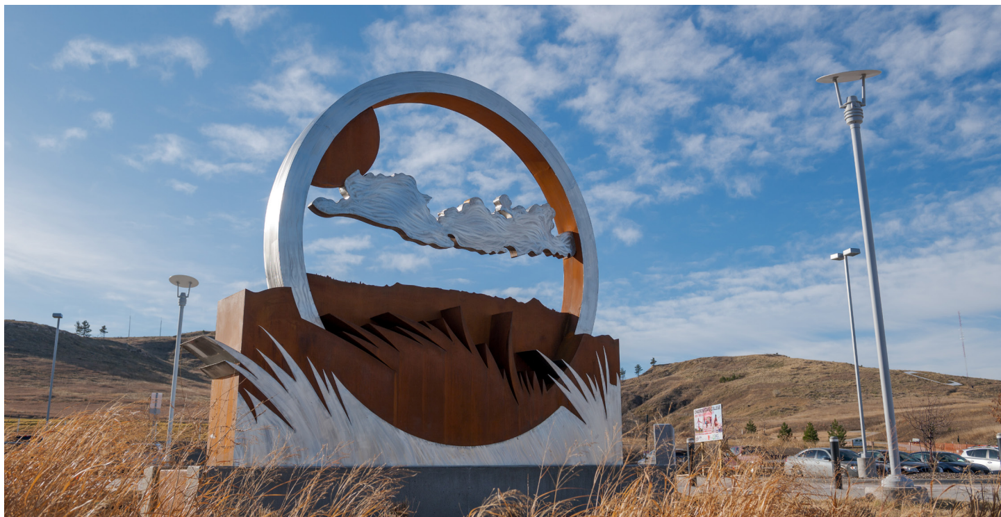
“Heart and Soul,” an outdoor sculpture by Karen Yank of Albuquerque, New Mexico, was dedicated in October 2019 at the Chicoine Center Plaza. The 12-foot high, 14-foot wide sculpture weighs about 2,000 pounds. It is made of steel, stainless steel, and a metal with a high copper content. Yank said she uses sandblasting and acid to accelerate the rusting process and its associated colors.

You can join ConnectCSC at csc.edu/connect . For information about alumni events, reunions and campus news about your alma mater, visit csc.edu/alumni .